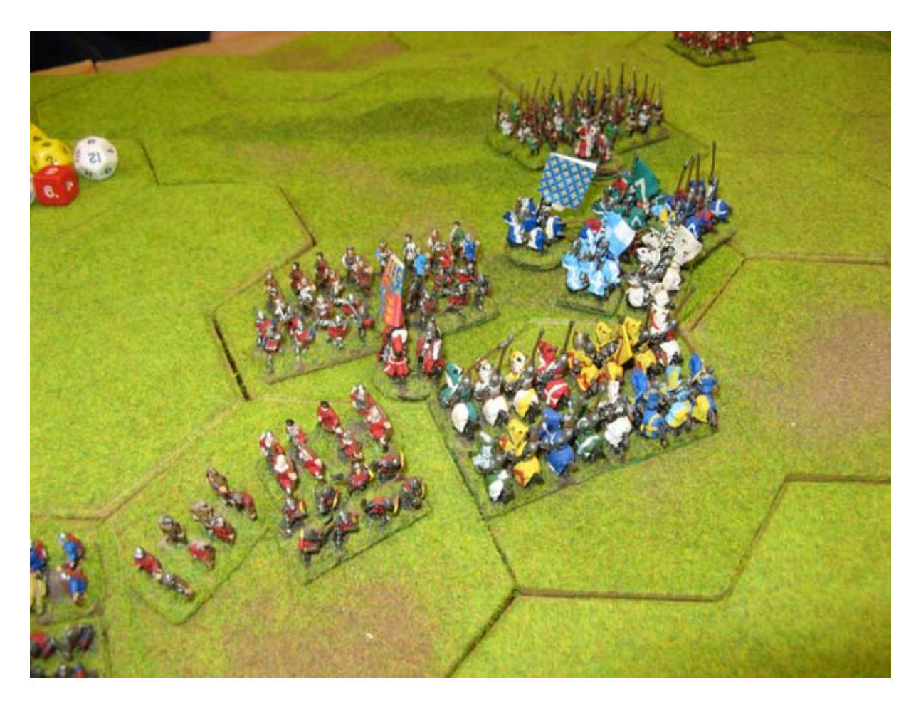
Edward III is captured and humiliated by the French!

The attack went in and at first everything went to plan – the English plan that is! On the extreme right one unit of longbowmen destroyed the mounted sergeants in front of them, and then advanced into the French to inflict more humiliation. Things weren't going much better for the French on the other flank, but in the centre the last of the heavy cavalry were launched once more into a do or die charge. This time they made contact with the longbowmen which for once failed to hit their targets with a round of abysmal shooting. The French horsemen broke through after massacring their opponents and found themselves facing King Edward III accompanied by only one unit of retinue. The rest of his retinue had been moved to support the flanks; in fact the only weak point in the English line was directly in front of the King. So Edward III was quickly surrounded and captured turning Crecy into a FRENCH VICTORY. In fact a fine example of the English grabbing defeat from the jaws of victory!